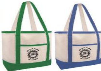
Anniversary Canvas Totes - $25 Each