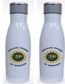
Anniversary Vacuum Bottles - $50 Each