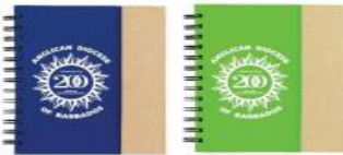
Anniversary Notebooks - $15 Each