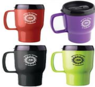
Anniversary Travel Mugs - $20 Each